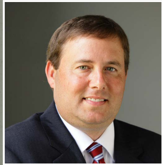
Partner, Georgia Olive Farms