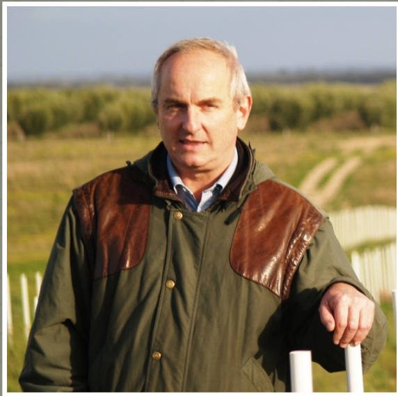
President, Australian Olive Association